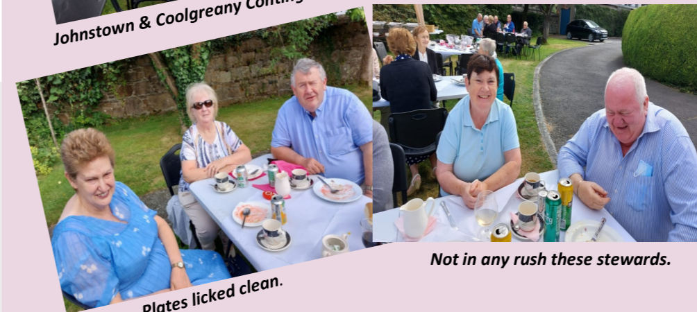
Plates licked clean.