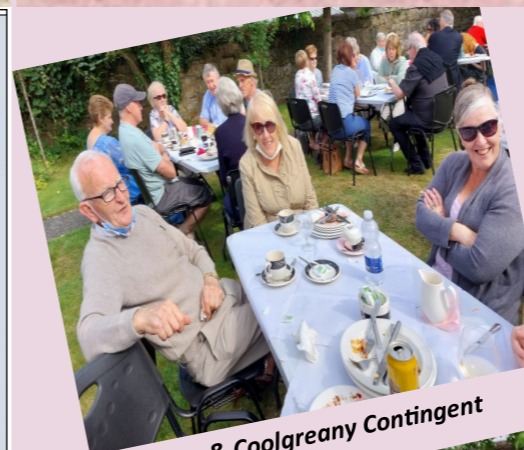
Johnstown & Coolgreany Contingent

Thanks to all our wonderful Volunteers who work in our Parish, On Thursday 21st of July a Special Mass of thanks and a Garden Party was held to show our appreciation for all the hard work the Volunteers do for our Parish. A special word of thanks to the Community Employment Scheme Workers who helped set up and prepare the Garden. Well done to all.