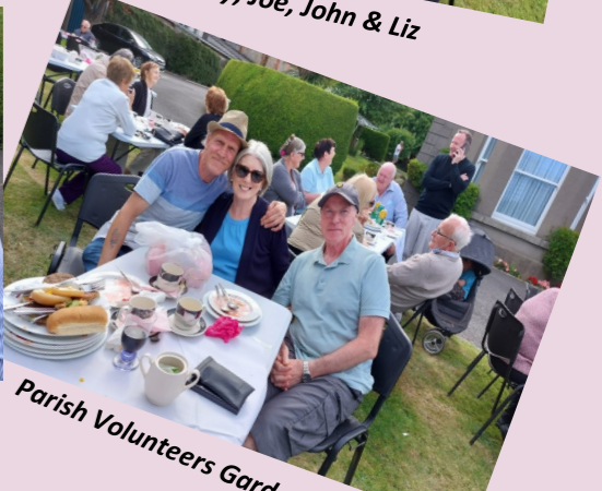
Parish Volunteers Garden Party